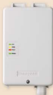
Internet and Digital Cellular Communicators