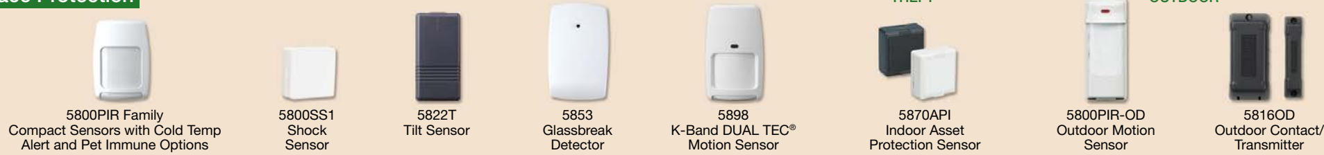
5800PIR Family Compact Sensors with Cold Temp Alert and Pet Immune Options 5800SS1 Shock Sensor 5822T Tilt Sensor 5853 Glassbreak Detector 5898 K-Band DUAL TEC® Motion Sensor 5870API Indoor Asset Protection Sensor 5800PIR-OD Outdoor Motion Sensor 5816OD Outdoor Contact/Transmitter