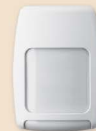
Pet Immune Motion Sensor