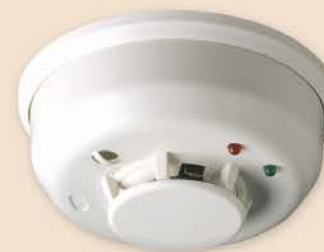
Monitored Smoke and Heat Detector