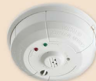
Monitored Carbon Monoxide Detector