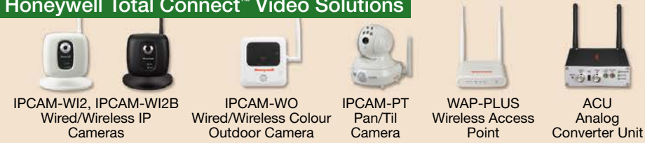
IPCAM-WI2, IPCAM-WI2B Wired/Wireless IP Cameras IPCAM-WO Wired/Wireless Colour Outdoor Camera IPCAM-PT Pan/Til Camera WAP-PLUS Wireless Access Point ACU Analog Converter Unit