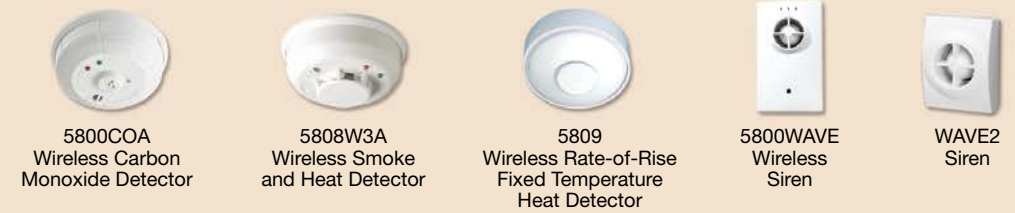
5800COA Wireless Carbon Monoxide Detector 5808W3A Wireless Smoke and Heat Detector 5809 Wireless Rate-of-Rise Fixed Temperature Heat Detector 5800WAVE Wireless Siren WAVE2 Siren