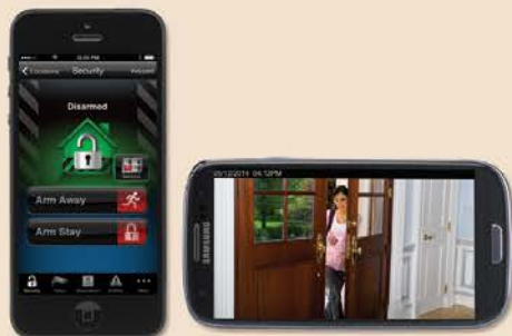
Honeywell Total Connect™ Remote Services