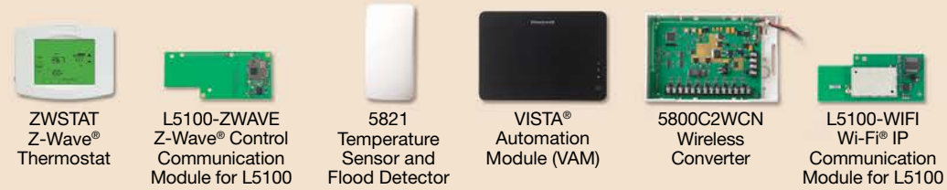
ZWSTAT Z-Wave® Thermostat L5100-ZWAVE Z-Wave® Control Communication Module for L5100 5821 Temperature Sensor and Flood Detector VISTA® Automation Module (VAM) 5800C2WCN Wireless Converter L5100-WIFI Wi-Fi® IP Communication Module for L5100