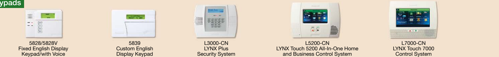
5828/5828V Fixed English Display Keypad/with Voice 5839 Custom English Display Keypad L3000-CN LYNX Plus Security System L5200-CN LYNX Touch 5200 All-In-One Home and Business Control System L7000-CN LYNX Touch 7000 Control System