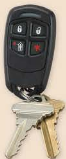
Four-button Remote Key