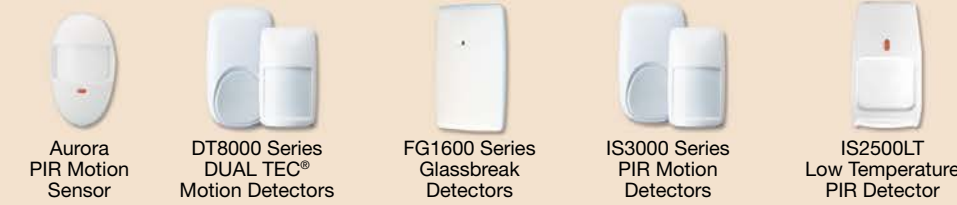
Aurora PIR Motion Sensor DT8000 Series DUAL TEC® Motion Detectors FG1600 Series Glassbreak Detectors IS3000 Series PIR Motion Detectors IS2500LT Low Temperature PIR Detector