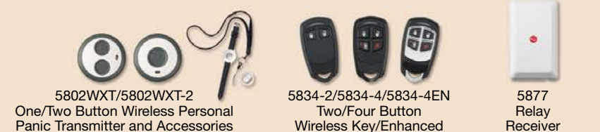
5802WXT/5802WXT-2 One/Two Button Wireless Personal Panic Transmitter and Accessories 5834-2/5834-4/5834-4EN Two/Four Button Wireless Key/Enhanced 5877 Relay Receiver