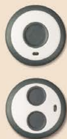
Wireless Personal Panic Transmitters