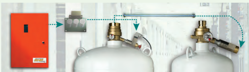
Impulse Valve Operator (IVO) w/ Manual Strike Button, IRM and up to 6 containers equipped w/ Impulse Valve Pneumatic Operators (IVPO)