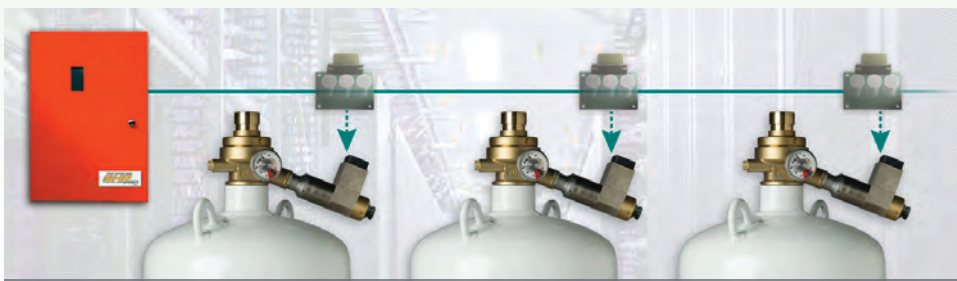
Electric Actuation – Multi-Container System w/ Impulse Valve Operator (IVO)